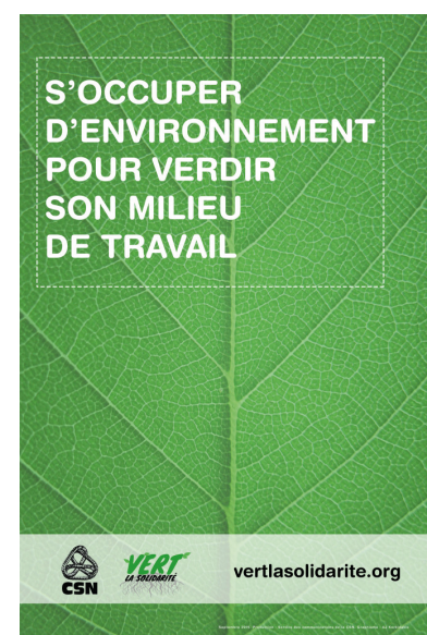
Poster : Vert la solidarité

The Vert la solidarité (Towards green solidarity) campaign was a tool made available to unions to help workers realize the importance of taking action on the environment. An internal sustainable development policy was also adopted to support the CSN and its affiliated organizations in incorporating the various aspects of this concept. Other themes like social acceptability (social licence) and protection of water were also addressed by the committee.