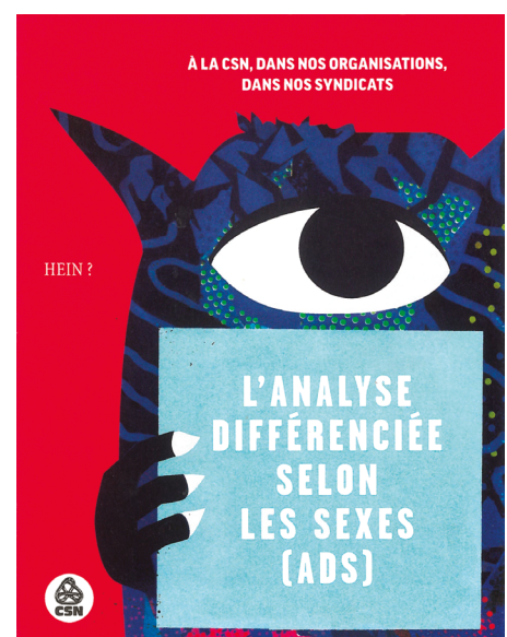
Leaflet : L'analyse différenciée selon les sexes (ADS)

Disseminated the CSN's abolitionist position on prostitution; continued the various struggles against violence against women; raise the profile of the national committee, its work and positions; supported the mission of women's groups, in particular at the Fédération des femmes du Québec (FFQ); organized March 8, International Women's Day.