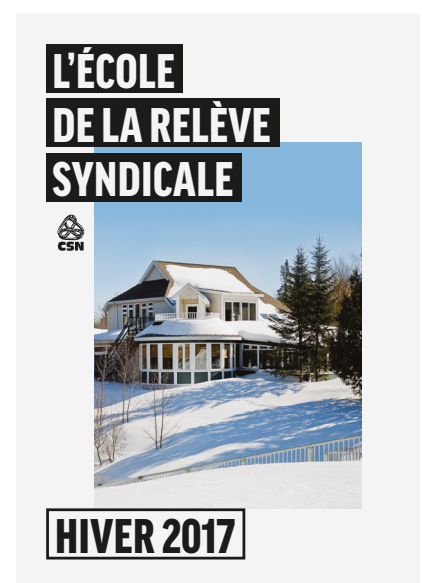
Brochure : École de la relève syndicale, winter 2017

The committee’s outlook and plans for the next three years are certainly ambitious, but the dynamism with which it tackled its work from 2014 to 2017 suggests that these new objectives for the 2017-2020 term will be achieved.