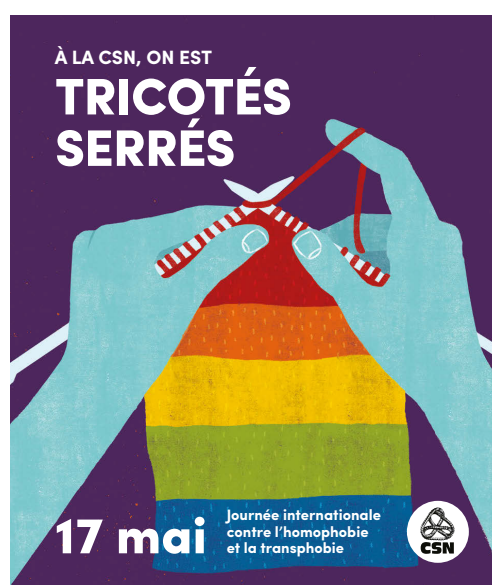
Poster : À la CSN, on est tricotés serrés.

2. An Act to strengthen the fight against transphobia and improve the situation of transgender minors in particular. The act amends the Civil Code to allow a minor child to have the director of civil status change the gender appearing on their birth certificate. It also amends the Charter of Human Rights and Freedoms to provide explicit protection against discrimination based on gender identity or expression.