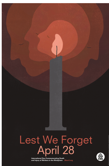
Poster: April 28 th 2017

These conditions can contribute to an increase in the frequency of various psychological problems. As well, overwork can increase the number of work accidents and exposure to unhealthy chemicals.